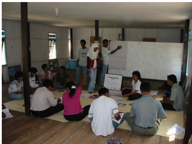
Local stakeholder meeting

This is a fundamental transformation in park management towards a more professional management system. The involvement of the public sector, tourism sector and local communities will be assured through their ongoing representation in the advisory council to the collaborative park management consisting of three divisions: public sector, local communities living in and around the Park and the private tourism sector. This represent a groundbreaking policy experiment for the government of Indonesia and for management of protected areas in general.