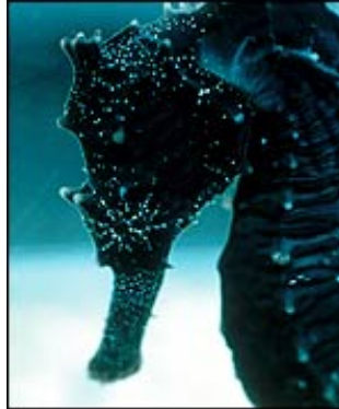
Seahorses are under great pressure

EJF also wants consumers to avoid buying prawns until supermarkets can prove they have been sustainably caught.