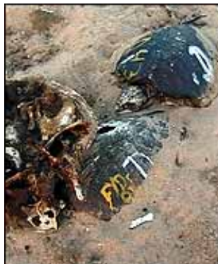
Turtles: Victims of the prawn fishery