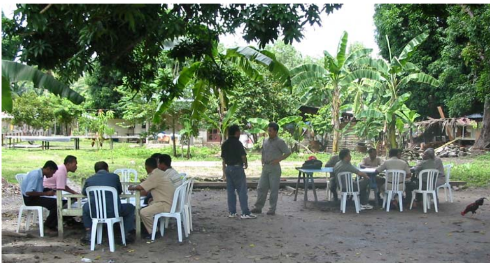
Figure 6.2. Break-out sessions during the workshop on marine conservation and sustainable resource use held at Saonek, Raja Ampat. Facilities in Raja Ampat are very basic, which is typical for newly established districts.