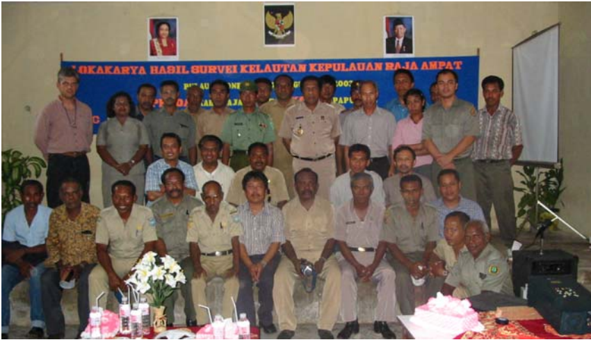
Figure 6.3. Group photo of participants of the workshop on marine conservation and sustainable resource use held at Saonek, Raja Ampat.