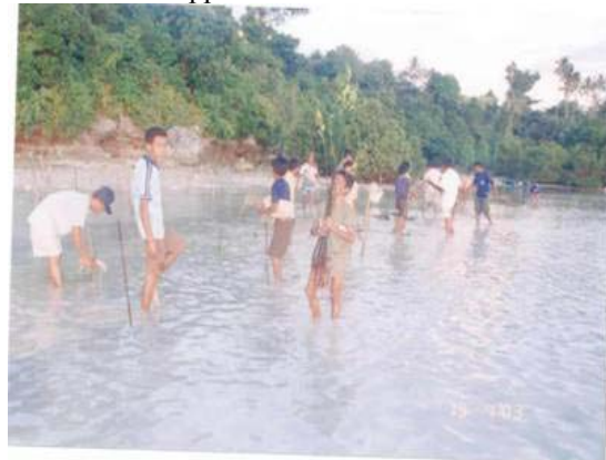
5.4. Earth day and Forestry day events April 22 nd 2003 .Mangrove planting activity at West Waitii village.