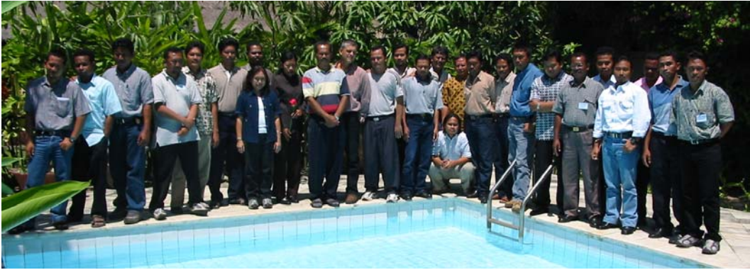
Figure 6.4. Group photo of participants (including participants from Raja Ampat) from of the course on Marine Protected Area Management and Planning, held in Bali.