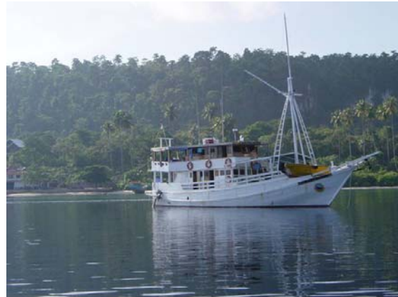
5.2. Floating Ranger Station Salmon: a multi purpose live-aboard that was used for REA (May 3 – 16 2003) and will play an important role for enforcement support in the Park