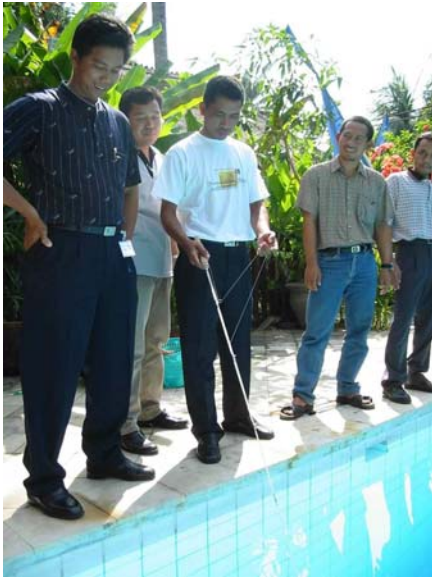
5.1 MPA Training at TNC SEA CMPA (September 2003). Participants performed a simulation of reef fishery management